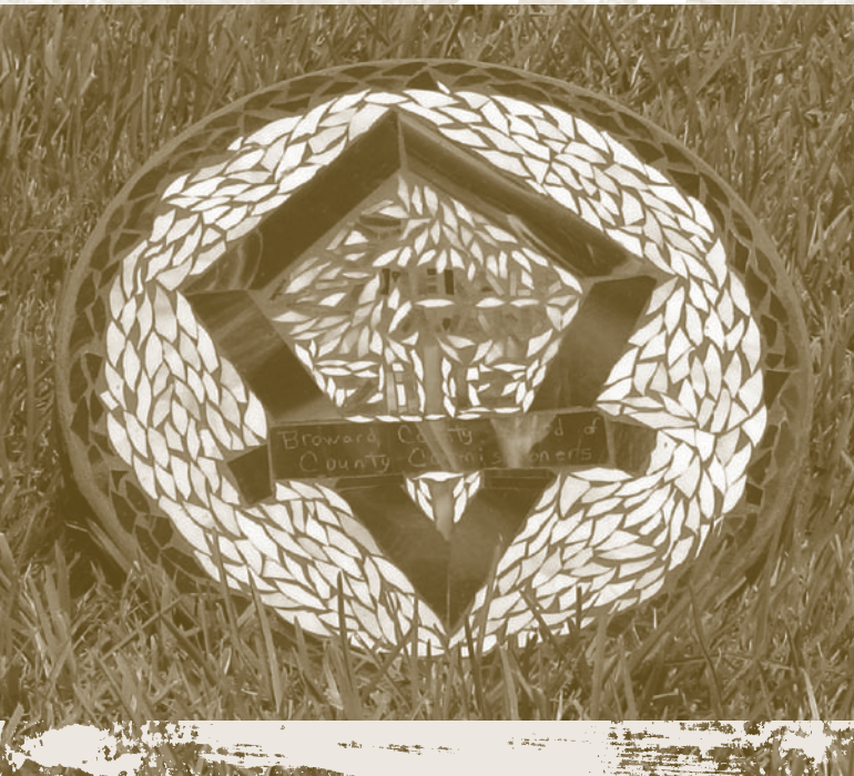
The Emerald Award, a handcrafted mosaic stepping stone created by students and faculty of Cross Creek School

The Emerald Award, a handcrafted mosaic stepping stone created by students and faculty of Cross Creek School, will be given a place of honor in the landscape and is presently on display at Town Hall for all to enjoy.